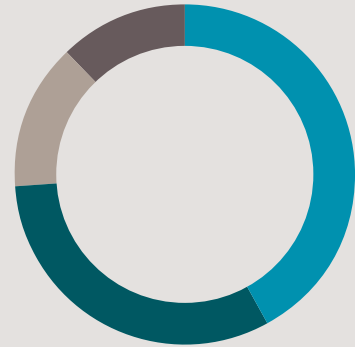
Current investors by geography (by number)